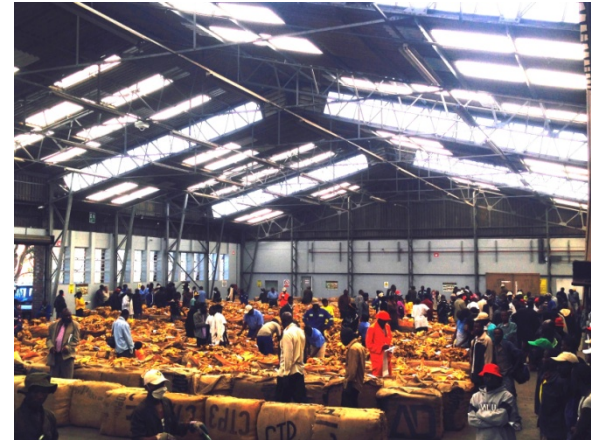
Left Insert: Increased Deliveries As the season progresses at CTP.