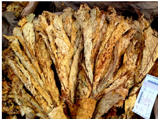
Left Insert: 3 rd Quality Lemon Leaf with little Spot on offer at CTP.