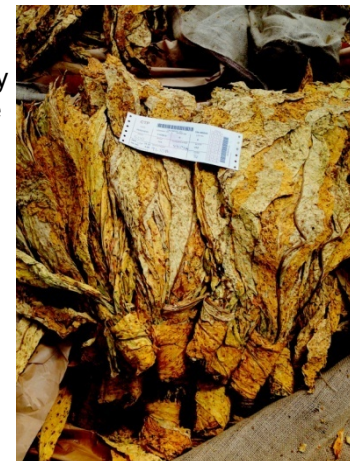
Left Insert: 1 st Quality Ripe Orange Leaf with Spot on Offer at CTP.