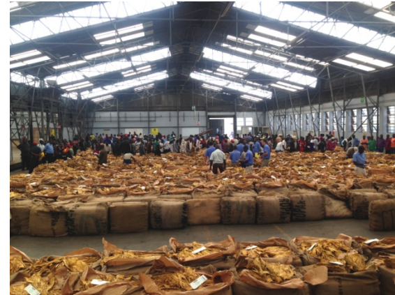
Left Insert: Increased Deliveries As the season progresses at CTP.