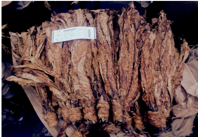
Left Insert: 2 nd Quality Ripe Orange-Mahogany Leaf with Spot on offer at CTP.