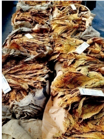
Left Insert: A crop Comparison between Ripe orange leaf and Soft lemon Leaf.